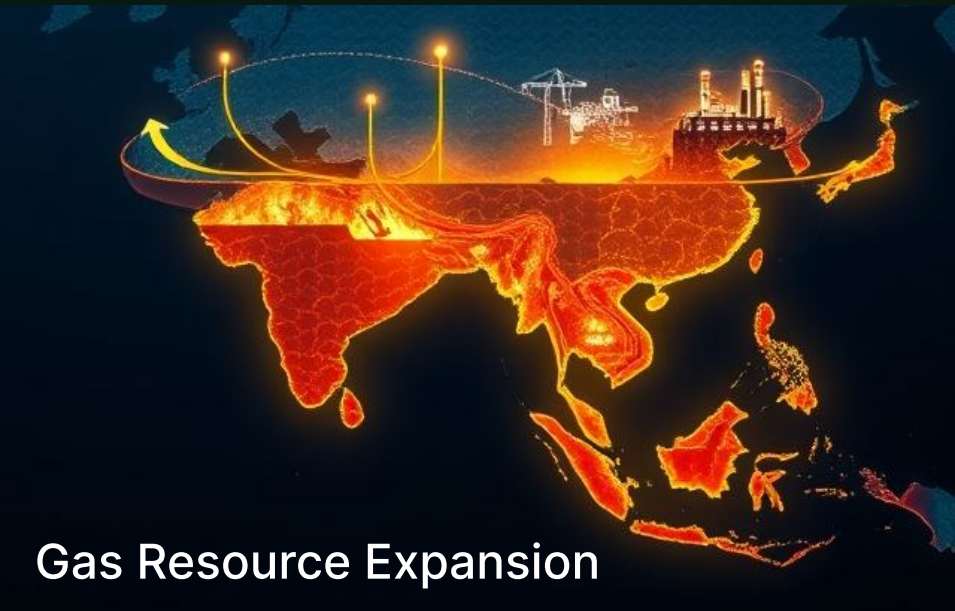
Gas Resource Expansion

in the Tangguh UCC carbon capture project in Indonesia.