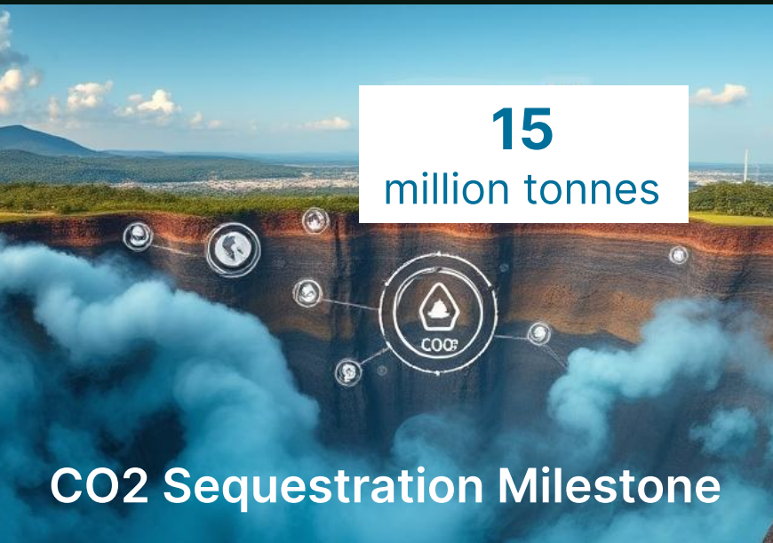
CO2 Sequestration Milestone

cubic feet of gas, driving energy demand across Asia.